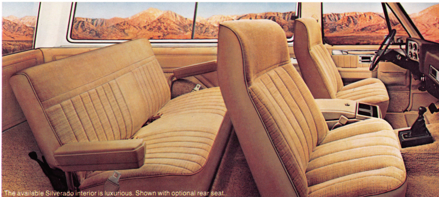
The available Silverado interior is luxurious. Shown with optional rear seat.