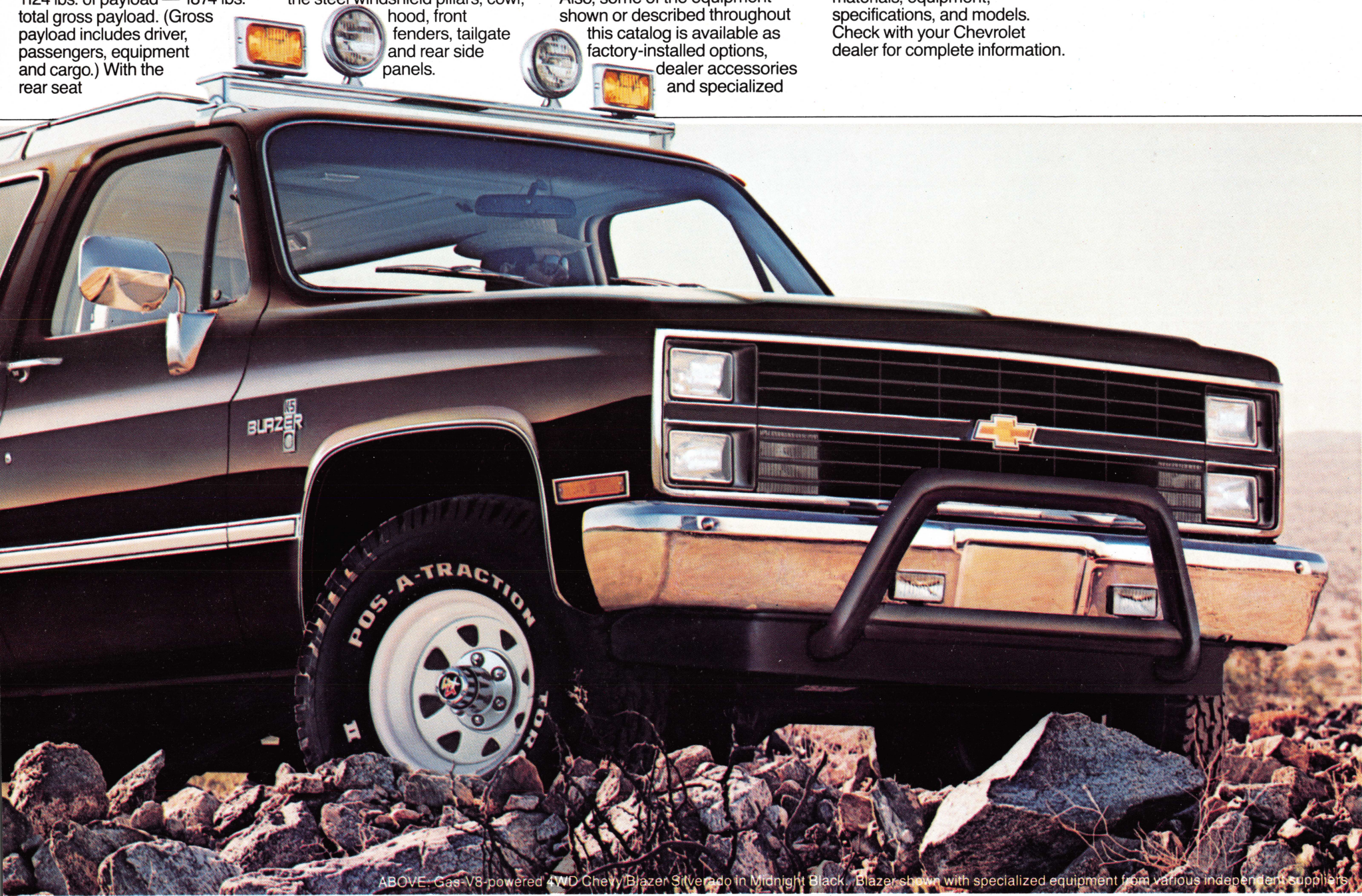
ABOVE: Gas-V8-powered 4WD Chevy Blazer Silverado in Midnight Black. Blazer shown with specialized equipment from various independent suppliers.

Tires supplied by various manufacturers.