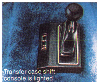
Transfer case shift console is lighted.