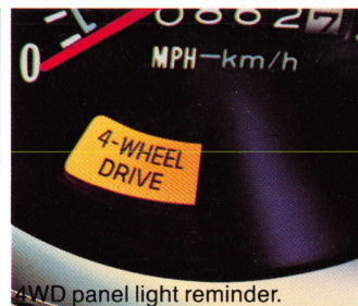
4WD panel light reminder.