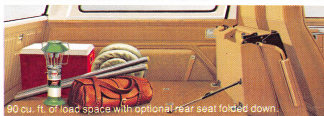
90 cu. ft. of load space with optional rear seat folded down.